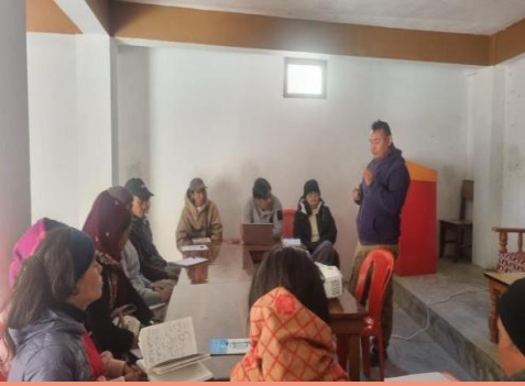
Safeguarding Session at BBaGS enumerator orientation at Dolpa