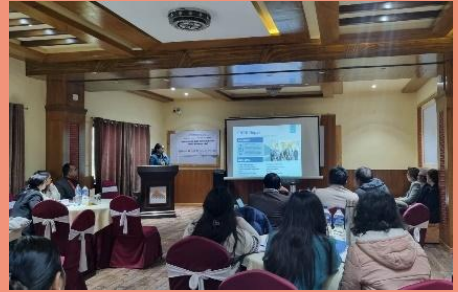
PHASE Finding Presentation at Dang