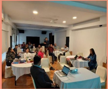
Workshop for the Case definition of diseases for the SPEED program