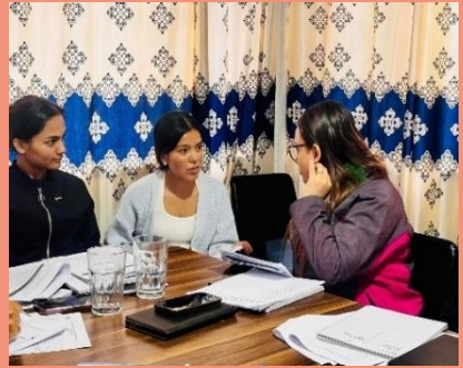
Mock sessions during BNA training