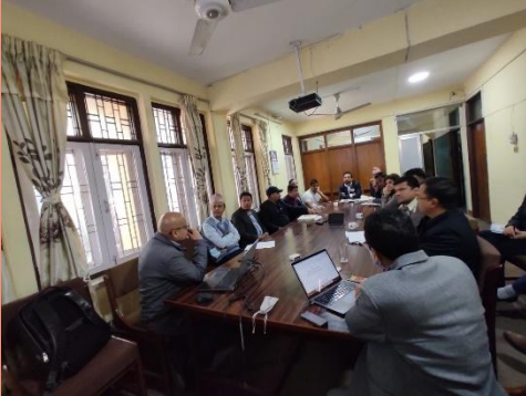
Meeting at CSD for guideline development