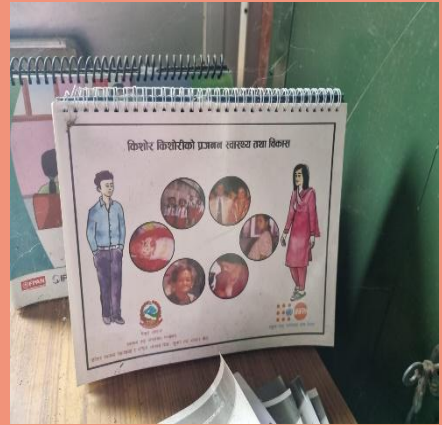
ASRHR IEC Materials