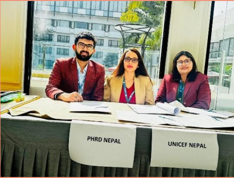
Glimpse of NMICS orientation