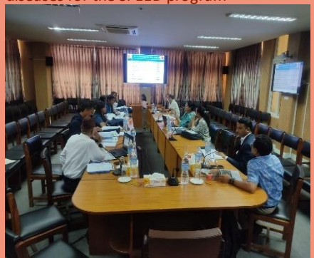
NMICS Meeting With UNICEF, NSO and PHRD Nepal