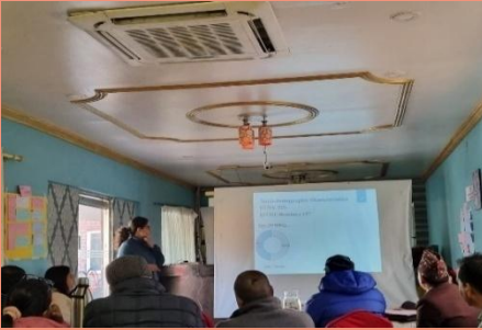
PHASE Finding Presentation at Surkhet