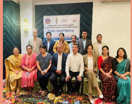
Kickoff meeting with FIND and PMWH team