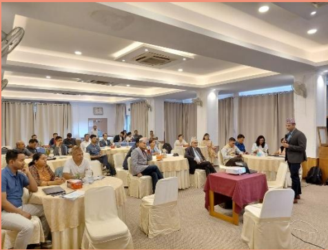
CBIDS guideline finalization workshop