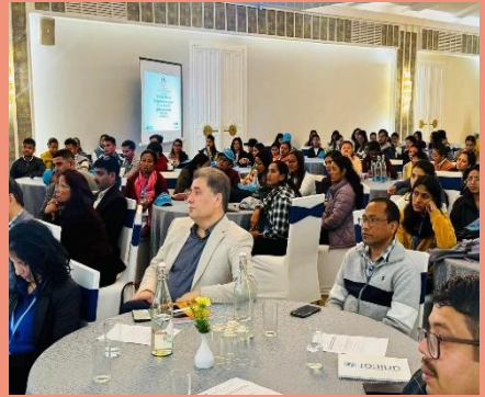
Glimpse of the NMICS orientation day