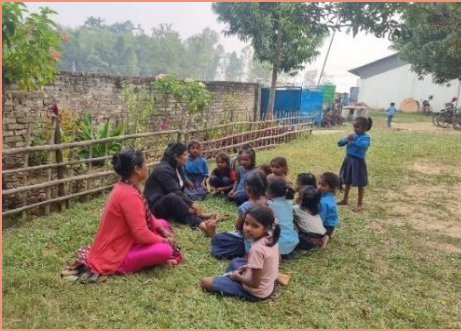
Field Visit to School for CMC PCMHP Project