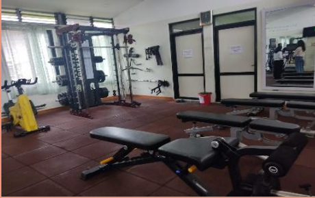
Sunita Project Therapy Room