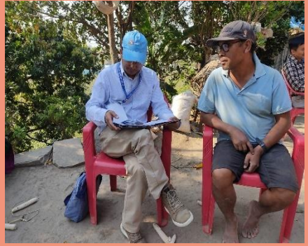
NMICS Data Collection