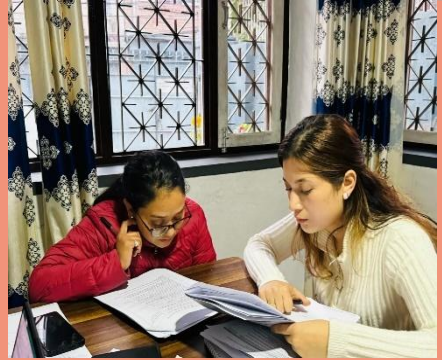
Mock sessions during the PHASE data collection orientation