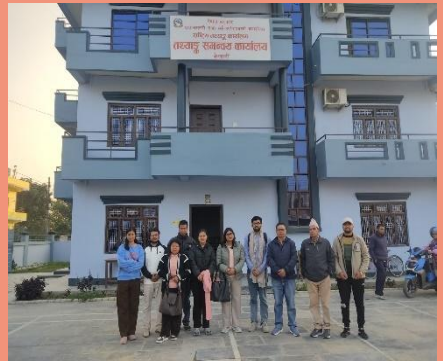
Field Monitoring at Kailali