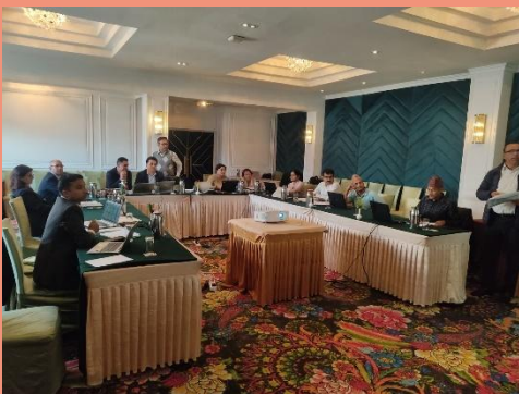
NMICS Tools finalization workshop