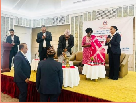
Inauguration of NMICS Training