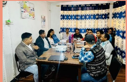
BNA Training Conducted at PHRD Nepal