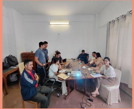
CBIDS Guideline development meeting