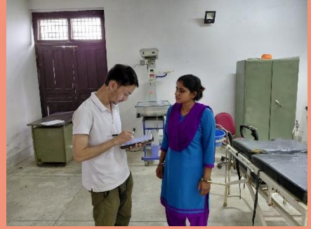
Health facility assessment for Survey