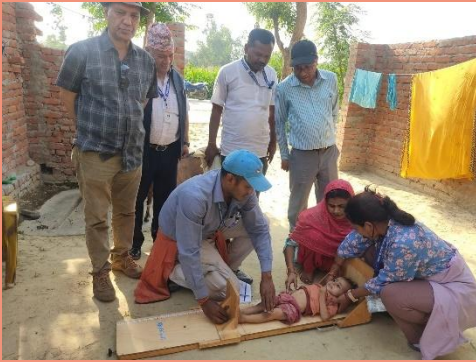
Height measurement of a child during NMICS