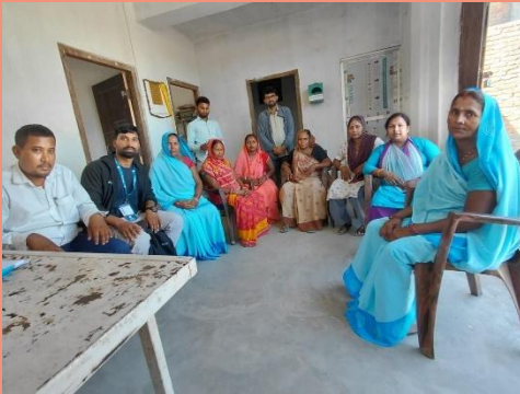
Conduction of FCHV meeting during survey