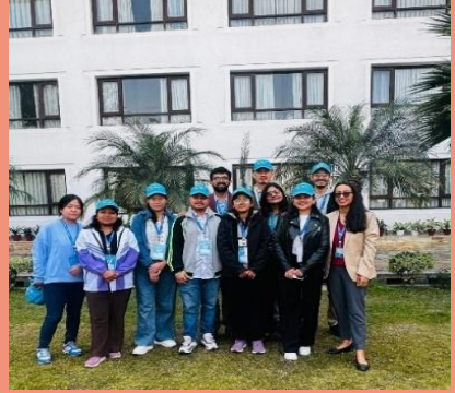
With some of the trainees of NMICS