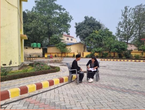
Key Informant Interview with One of the Participants