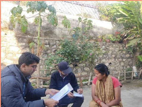
Data Collection in the field